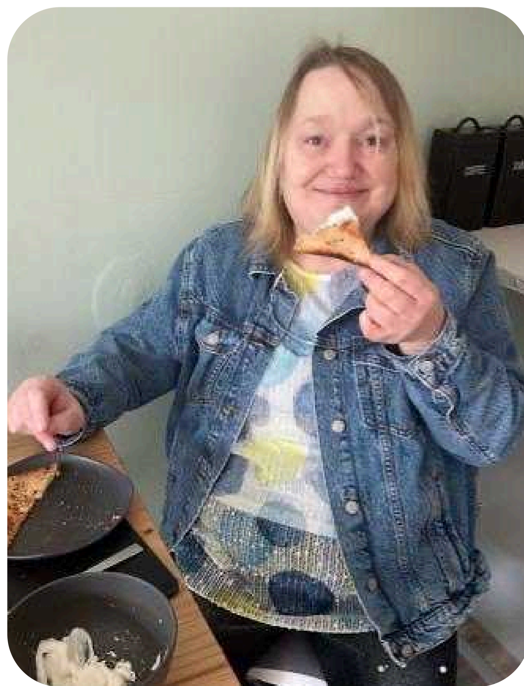
Our New Resident

Built confidence through creative activities, community visits, managing finances, and daily living routines.